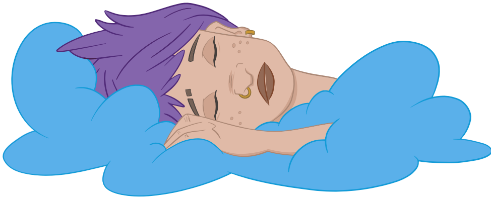
Gender Neutral Figure