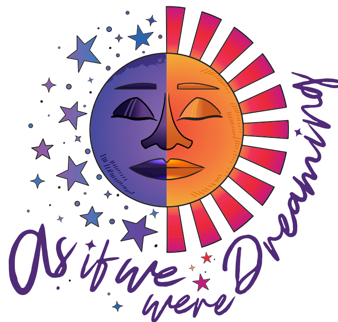
Primary Logo without Location Text

When the website needs to be embedded within the graphic and cannot be listed in body copy this version is to be used.