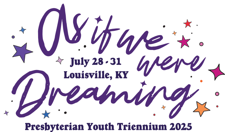
Title + Location Text

This version should be used when the sun/moon graphic cannot be accommodated.