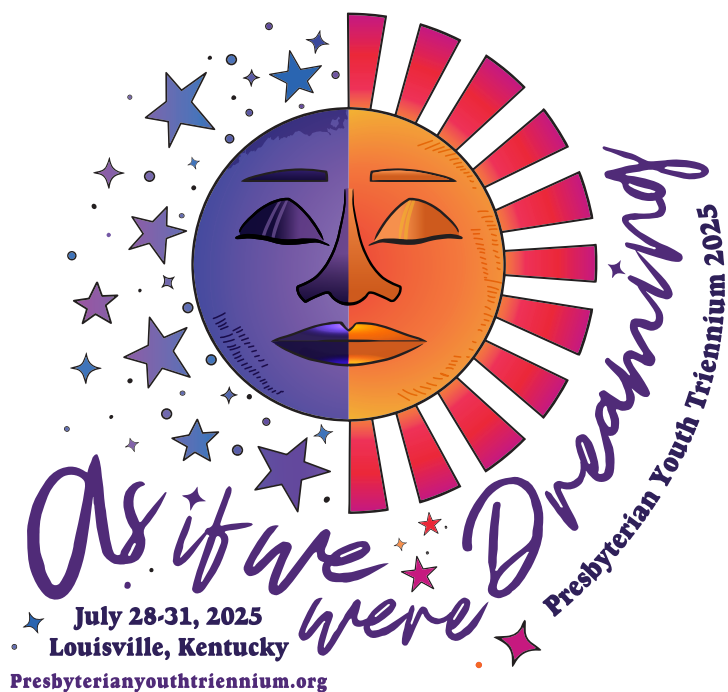
Primary Logo + Website

When the website needs to be embedded within the graphic and cannot be listed in body copy this version is to be used.